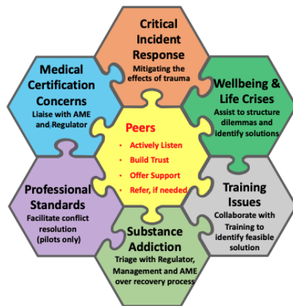
Diagram 2: The different dimensions of peer support

Diagram 2 focuses on the Peer Support piece of Diagram 1, elaborating on its different elements and core topics.