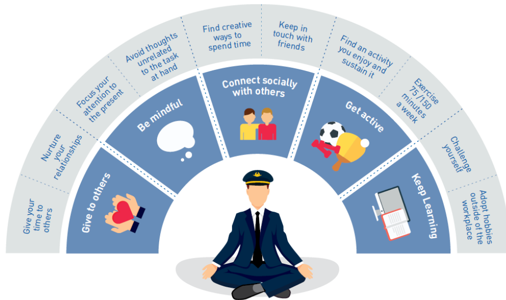
HOW TO KEEP MENTALLY WELL Fitness to Fly – A Medical Guide for Pilots (International Civil Aviation Organization), 2018

Self-care is a critical component of well-being and supports personal health in all dimensions (i.e., physical, mental and social well-being).