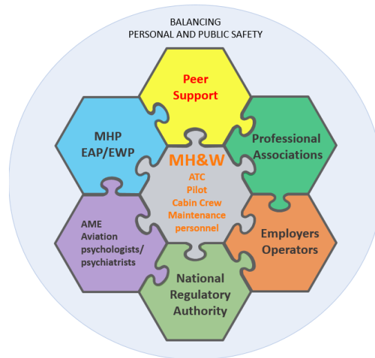
Diagram 1: Creating a Positive Safety Culture through promoting Personal Well-Being and Public Safety

The World Health Organization (WHO) defines health as a state of complete physical, mental and social well-being and not merely the absence of disease or infirmity. Mental health is further defined as a state of well-being in which the individual realizes his or her own abilities, can cope with the normal stresses of life, can work productively and fruitfully, and is able to make a contribution to his or her community.